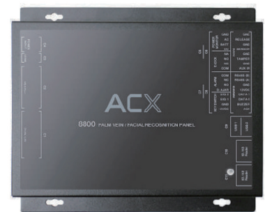
8800 Palm Vein / Facial Recognition Panel